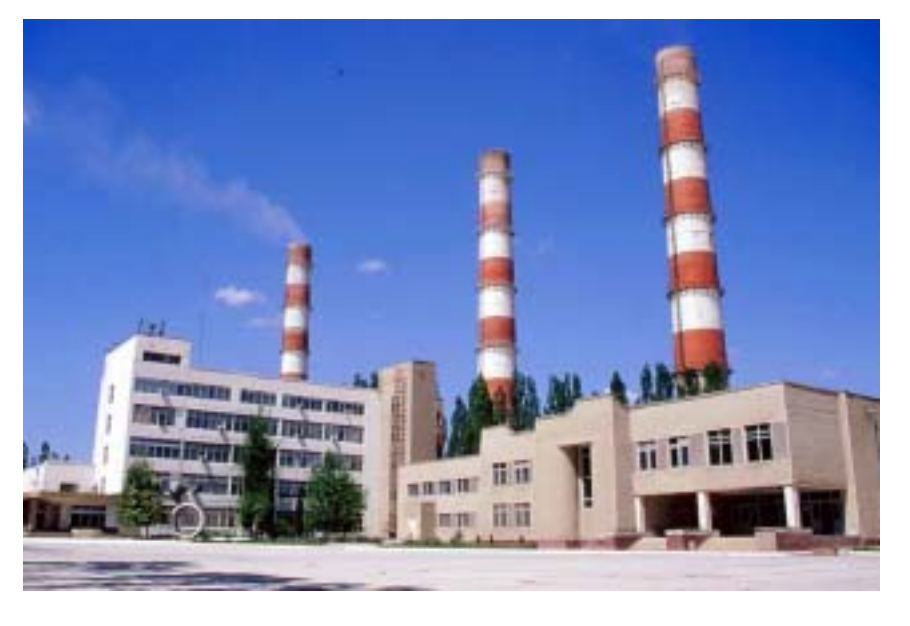
<sup>1</sup> The Project Design Document (PDD) for the project "0001. Switch from wet-to-dry process at Podilsky Cement, Ukraine" can be downloaded from http://ji.unfccc.int/JI_Projects/Verification/PDD; The final determination report can be found at http://ji.unfccc.int/JI_Projects/Verification/FinDet.html

In the case of dry cement production, the raw materials are mixed without water and therefore the evaporation process can be omitted. The latter technology results in 53% reduction of energy consumption which would be needed for the wet production process.